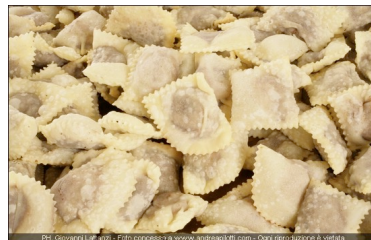
CALGIONETTI ABRUZZESI Abruzzo sweet Christmas-time