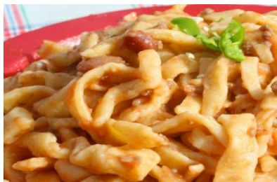
Local served at